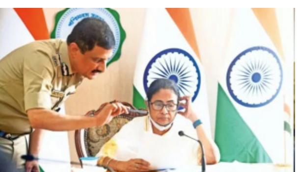
April 20

A day after five persons were killed and several others were injured in a bus accident in Odisha's Jajpur district, the West Bengal government on Tuesday deployed teams of administrative officials along with relief materials for the injured passengers from the state. At least five people, including a woman, died and around 35 others were injured after a bus fell from a bridge in Odisha's Jajpur district on Monday evening. The injured included around 24 passengers from Bengal - 12 from Purba Medinipur, one from Uttar Dinajpur and the remaining 11 are Kolkata and Howrah districts. Taking to X, West Bengal Chief Minister Mamata Banerjee condoled the deaths and said the families of the victims will be granted compensation....Bengal has been sending officials, materials, ambulances etc. to the site in Odisha for rescue assistance. ... Beds have been reserved in Medinipur medical college. Compensation will be paid to the next of kin of the dead and the injured as per rules," Banerjee