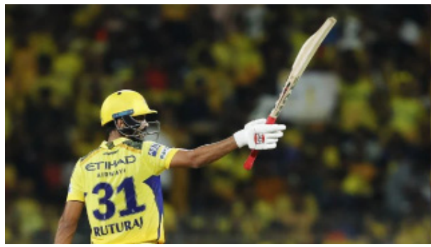
GNS News Agency, April 26

Ruturaj Gaikwad century Ruturaj Gaikwad (c) of Chennai Super Kings celebrating his half century during match 39 of the Indian Premier League season 17 (IPL 2024) between Chennai Super Kings and Lucknow Super Giants held at the MA Chidambaram Stadium, Chennai on the 23rd April 2024. (Photo by Saikat Das / Sportpics for IPL)